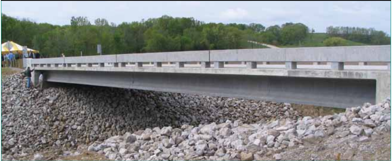
Figure 1. This Wapello County, Iowa, structure was the first UHPC bridge constructed in the United States.

concrete elements were constructed in New York. In one case, the UHPC was used in transverse connections between precast deck panels. In the other case, the UHPC was used in longitudinal connections between the top flanges of deck-bulb-tee girders (see figure 2). Field-cast UHPC will also be used in the longitudinal and transverse deck-level connections of the UHPC waffle slab bridge.