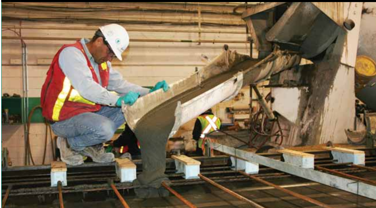
Figure 3. UHPC is delivered via truck chute to a precast girder form. UHPC can be used in both precast and field-cast applications.

Immediately after casting, any exposed UHPC surface needs to be sealed with an impermeable layer. Metal, plastic, or plastic-coated wood are appropriate materials with which to seal the surface. The seal must rest against the UHPC and should not allow for any space between the covering material and the fresh concrete. Sealing of the surface eliminates the possibility of surface dehydration, which can lead to cracking and significant degradation of final material properties.