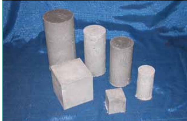
Figure 4. Either cylinders or cubes can be used for compression testing of UHPC.

(1 MPa/s) has been demonstrated to be acceptable, thus allowing for individual tests to be completed in a reasonable timeframe. (15)