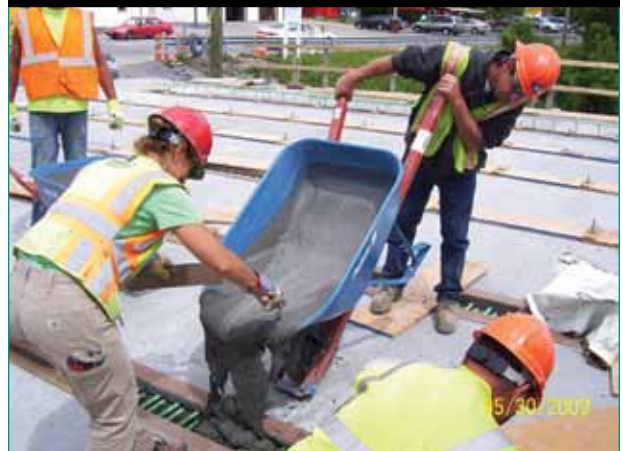
Figure 2. Longitudinal connections are cast between deck-bulb-tee girders on the Route 31 Bridge in Lyons, NY. Field-cast UHPC can simplify connection details and ease constructability.