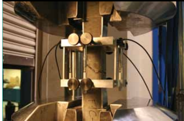
Figure 5. Testing procedures aimed at directly capturing the tensile behavior of UHPC are under development.

surface penetration of the water, localized hydration, and increased dynamic modulus. In practice, freeze-thaw testing can indicate that the UHPC performance is bolstered through exposure to these conditions, while in actuality the thaw portion of the cycle is facilitating delayed hydration and a requisite dynamic modulus increase.